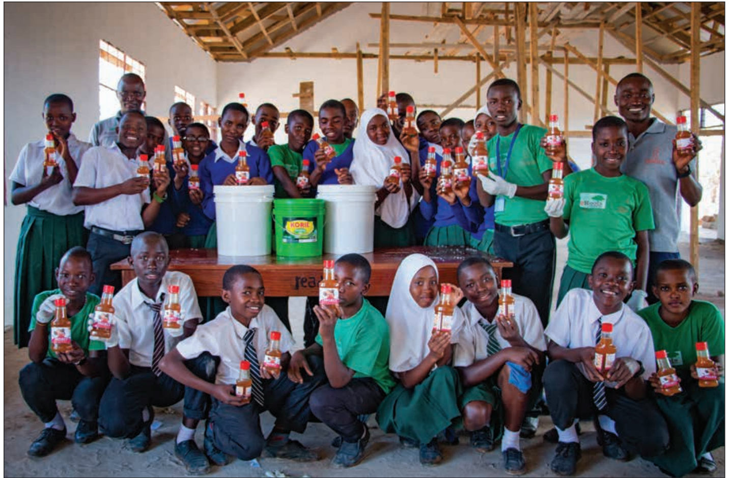
Students proudly show their first bottles of honey.

treatment, better nutrition and improve her quality of life.