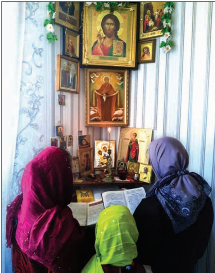
A family at our Pochaiv site

Lord Jesus Christ, Prince of Peace, bring peace to Ukraine and its people. We pray for their safety and strength as they endure the evils of war. We ask for Your protection over all our sponsored children, their families, and our staff in Ukraine. Amen.