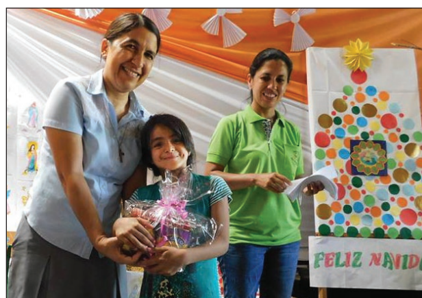
Sponsored girl receives Christmas gift at our CMAVIL site in Paraguay.

Through your generosity, you truly share God's love with the sponsored children and their families at Christmastime by making it possible for every site to have a celebration.