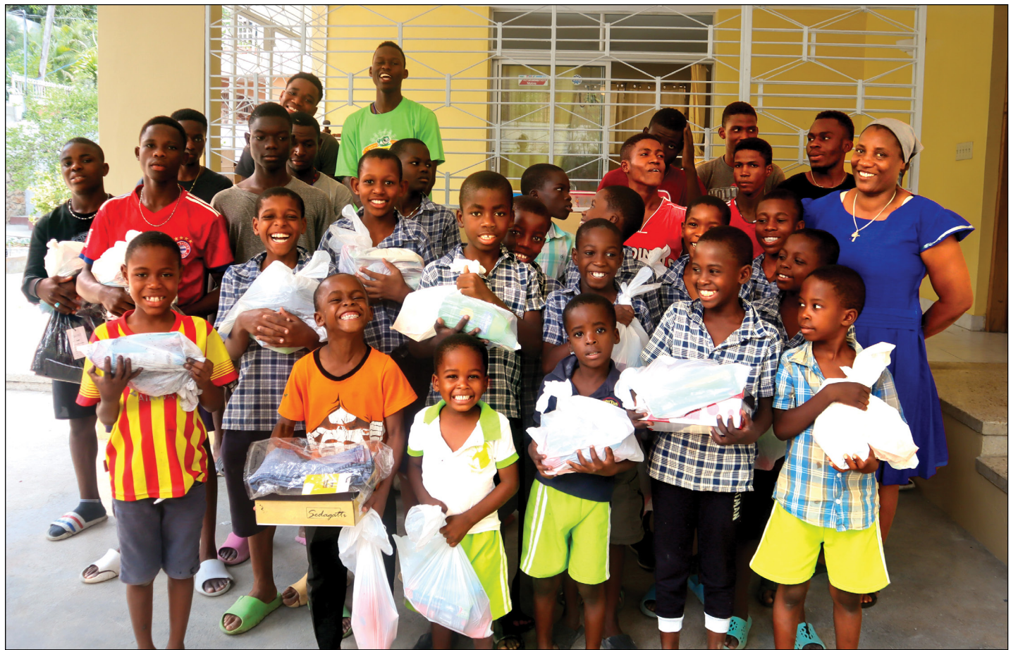
Children and staff in St. Dominique site are delighted with a gift of food and hygiene products.

“Sponsors bring joy, love and happiness to our children's hearts,” says